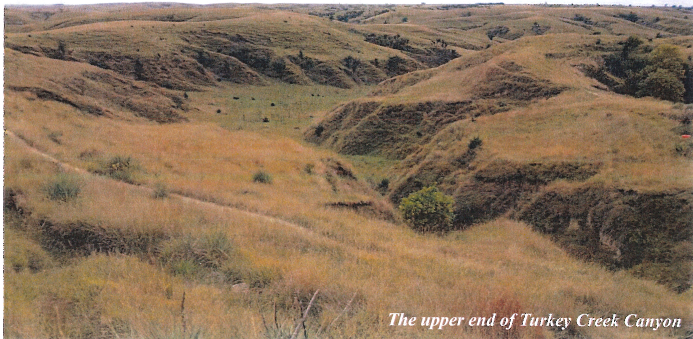
The upper end of Turkey Creek Canyon

The Platte-Republican Diversion Project will divert excess flows (streamflows above and beyond levels needed to fulfill existing water rights and instream target flows for endangered species) from the Platte River through the CNPPID canal system, and then discharge the flows into Turkey Creek, a tributary of the Republican River.